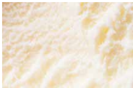
A close look at ice cream shows its porous structure.

sion—a combination of two liquids that do not normally mix together. Instead, one of the liquids is dispersed throughout the other. In ice cream, liquid particles of fat—called fat globules—are spread throughout a mixture of water, sugar, and ice, along with air bubbles (Fig. 1). If you examine ice cream closely, you can see that the structure is porous. A typical air pocket in ice cream will be about one-tenth of a millimeter across. The presence of air means that ice cream is also a foam. Other