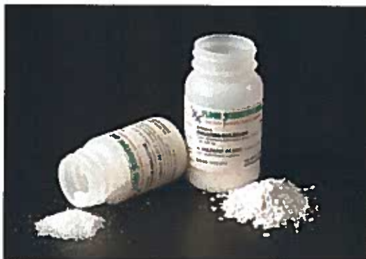
Sodium chloride and calcium chloride.

tals, water molecules do not have the same stable arrangement they have on the interior; they are more mobile and more reactive. So the surface ice reacts with the surface of the salt crystals, allowing a small amount of salty